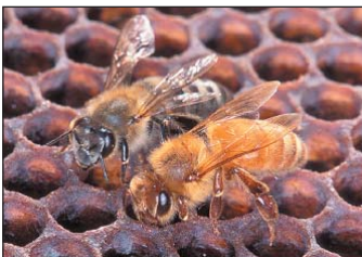
An Africanized honey bee (left) and a European honey bee on a honey comb. Despite color differences in these two individuals, the two strains cannot be distinguished visually.

Once away from the attack, remove the stingers as soon as possible. Stingers should be scraped out with a fingernail, knife or some other sharp object. Stingers continue to inject venom for many minutes after the initial sting. The sooner a stinger is removed, the less venom will be injected. If you