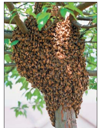
A honey bee swarm.

Because swarms do not have a nest to defend and the bees in the swarm are often full of honey, swarming bees are usually more docile than established colonies and less likely to sting. However, there is always a risk when working around bees. Therefore, Texas Cooperative Extension recommends that you contact a pest control professional to manage a swarm.