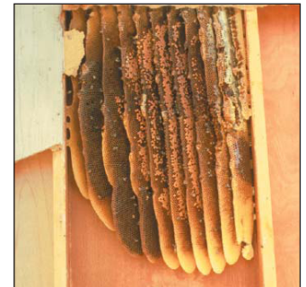
Bees can construct large wax nests rapidly once they enter a home. For this reason, both bees and nests should be removed as soon as possible.

Social wasps are quick to sting when defending their nests. Their attacks can be severe because they cooperate to defend the nest and because individual wasps can sting repeatedly. Honey bees can sting only once. Texas Cooperative Extension publication L-1828, Paper Wasps, Yellowjackets and Solitary Wasps , provides more information on wasps.