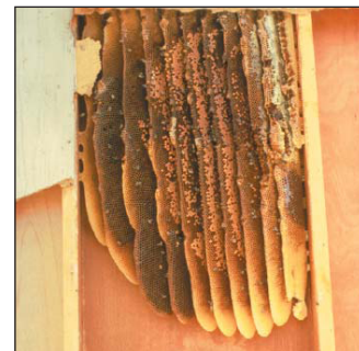
Bees can construct large wax nests rapidly once they enter a home. For this reason, both bees and nests should be removed as soon as possible.

Social wasps are quick to sting when defending their nests. Their attacks can be severe because they cooperate to defend the nest and because individual wasps can sting repeatedly. Honey bees can sting only once. Texas Cooperative Extension publication L-1828, Paper Wasps, Yellowjackets and Solitary Wasps , provides more information on wasps.