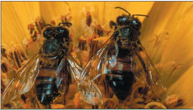
An Africanized honey bee (left) and a European honey bee. Despite size differences in these two individuals, the two strains cannot be distinguished visually.