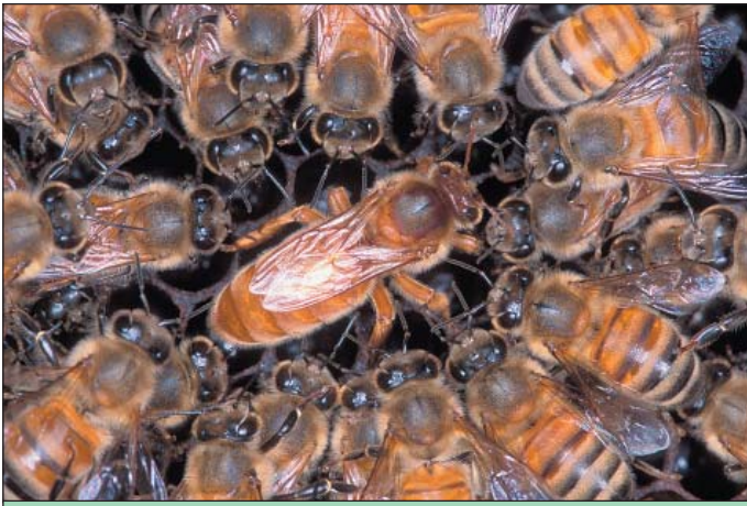
Honey bee workers surround a queen bee. Bees are likely to sting only when they perceive a threat to the nest and queen.