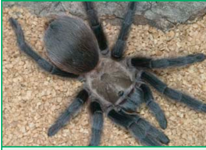
Figure 2. Tarantula, Aphonopelma .

are sometimes lined with silk webbing and are covered with a thin silk curtain. In the winter or the hottest months of summer, these burrows