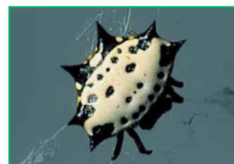
Figure 6. Spinybacked orbweavers are common in wooded areas.