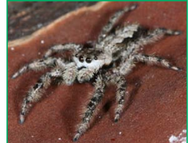
Figure 3. Adult jumping spider.

Hundreds to thousands of wolf spiders may live in the average backyard lawn, where they feed on insects and small organisms. Although they may be a nuisance, they can control other pests. Because they are so plentiful, wolf spiders commonly enter homes under gaps in doorways. Although some wolf spiders can be aggressive if handled improperly, they are generally not dangerous to people or pets and can usually be picked up with bare hands or