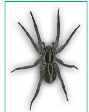
Figure 4. Wolf spider, Schizocosa spp.