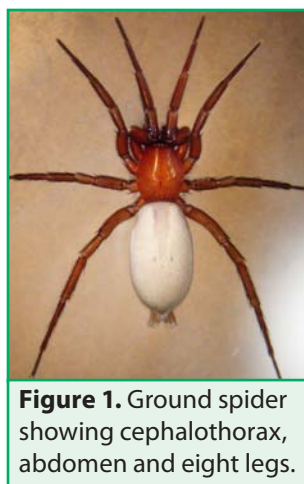
Figure 1. Ground spider showing cephalothorax, abdomen and eight legs.

The spinnerets and a distinct abdomen distinguish spiders from the other arachnids.